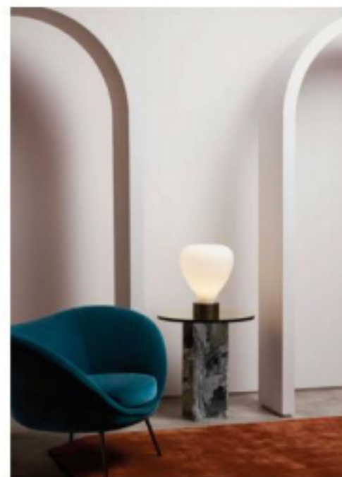
Pomme CTO Lighting

Inspired by the gentle curves of petals coming into bloom, the curve of Pomme's glass is achieved by experimenting with the material whilst still in its liquid form. The giant dimple at the centre gives the light a sculptural appeal.