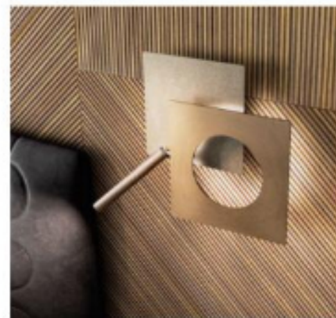
Petra Icône Luce

Characterised by square and regular shapes, Petra can be admired for its colours, an absolute peculiarity of the collection, which thanks to the careful selection of materials and tones, emerge in a unique way. Petra is available in Etruscan copper and brushed brass, Etruscan gold and silver, slate, white and ecru.