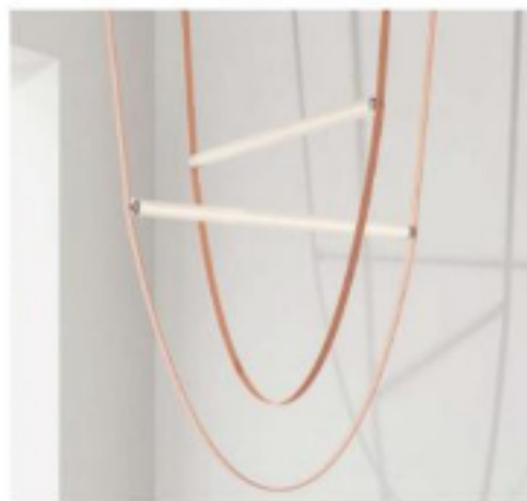
WireLine Formafantasma for Flos

Using the power cable as one of the main design features for this fixture, it is flattened to resemble a belt made of rubber and hangs from the ceiling. The cable holds a ribbed glass extrusion containing an LED and on a materials level the lamp plays on the contrast between the industrial feeling of the rubber and sophistication of glass.