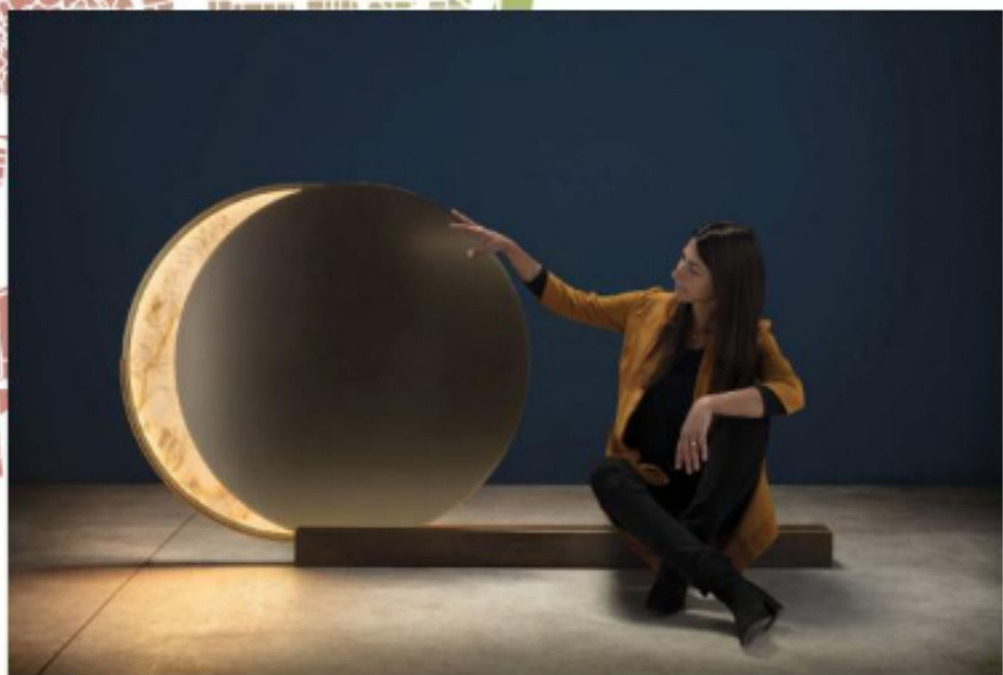
Alchimie T by Giulia Archimede Catellani & Smith

The antithesis between light and dark, between the Sun and Moon, is everlasting, like part of the same flow of existence. Many allegorical meanings have been given to the necessary relationship between two elements that each exist as a consequence of the other. The new lamp Alchimie T, designed by Giulia Archimede for Catellani & Smith, investigates this dimension, whose components are diametrically opposed but always, and forever, connected. Alchimie T is an exquisite sculpture composed of two discs in brass and alabaster - the latter used for the first time in a Catellani & Smith creation - that, with a light touch of the hand, slide in parallel to one another on a track-base made of medea limestone. The interaction between light and shade reaches its peak the moment when the two discs overlap and almost mimic an eclipse. The movement, by changing both form and light intensity of the lamp to create a new ambience in the room, provides a unique user experience. Alchimie T forges a partnership between object and user, who is made to feel at ease and finds a connection with the space around them.