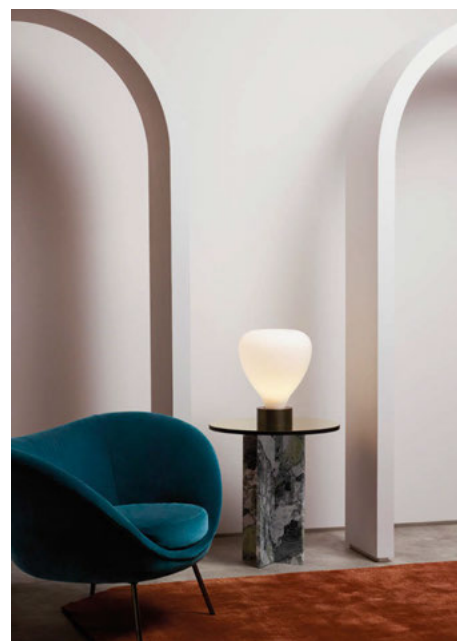
Pomme CTO Lighting

Inspired by the gentle curves of petals coming into bloom, the curve of Pomme's glass is achieved by experimenting with the material whilst still in its liquid form. The giant dimple at the centre gives the light a sculptural appeal.