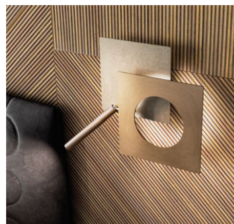
Petra Icone Luce

Characterised by square and regular shapes, Petra can be admired for its colours, an absolute peculiarity of the collection, which thanks to the careful selection of materials and tones, emerge in a unique way. Petra is available in Etruscan copper and brushed brass, Etruscan gold and silver, slate, white and ecru.