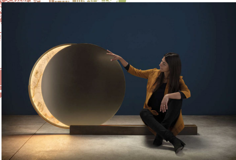
Alchimie T by Giulia Archimede Catellani & Smith

The antithesis between light and dark, between the Sun and Moon, is everlasting, like part of the same flow of existence. Many allegorical meanings have been given to the necessary relationship between two elements that each exist as a consequence of the other. The new lamp Alchimie T, designed by Giulia Archimede for Catellani & Smith, investigates this dimension, whose components are diametrically opposed but always, and forever, connected. Alchimie T is an exquisite sculpture composed of two discs in brass and alabaster - the latter used for the first time in a Catellani & Smith creation - that, with a light touch of the hand, slide in parallel to one another on a track-base made of medea limestone. The interaction between light and shade reaches its peak the moment when the two discs overlap and almost mimic an eclipse. The movement, by changing both form and light intensity of the lamp to create a new ambience in the room, provides a unique user experience. Alchimie T forges a partnership between object and user, who is made to feel at ease and finds a connection with the space around them.