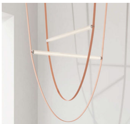
WireLine Formafantasma for Flos

Using the power cable as one of the main design features for this fixture, it is flattened to resemble a belt made of rubber and hangs from the ceiling. The cable holds a ribbed glass extrusion containing an LED and on a materials level the lamp plays on the contrast between the industrial feeling of the rubber and sophistication of glass.